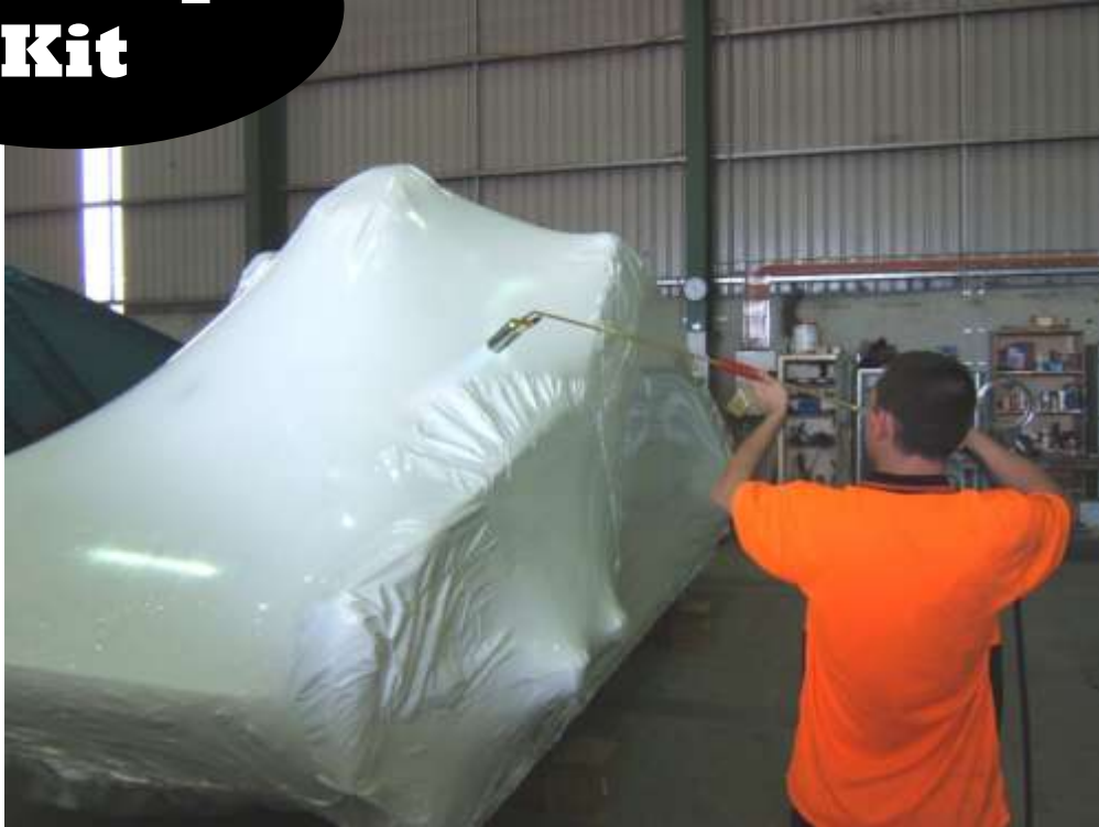
An operator using a Big Red with extension to shrink large areas.